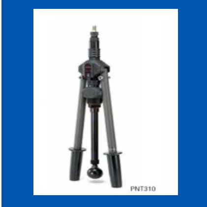
Hand Rivet Nut Tools