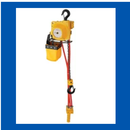
Endo Air Hoist AT SERIES