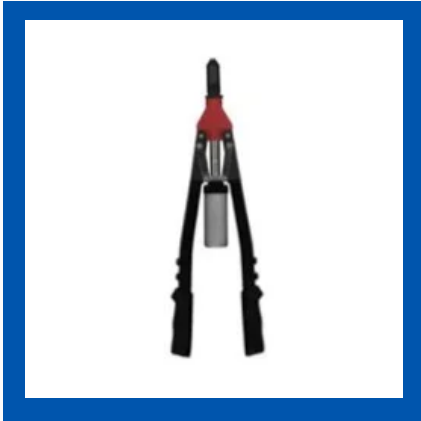
Hand Rivet Tools