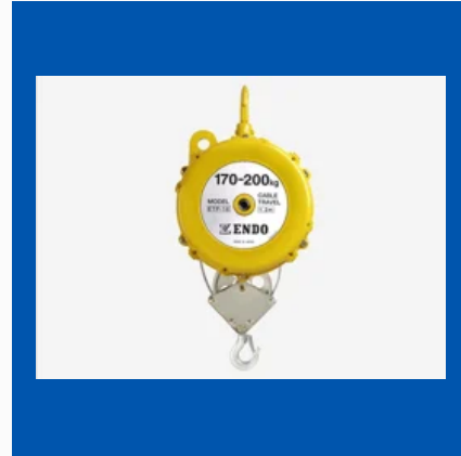
Spring Balancer 160kgs