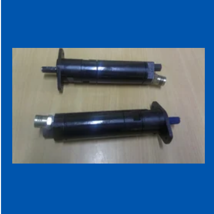
Pneumatic Air Motor- Reversible Type