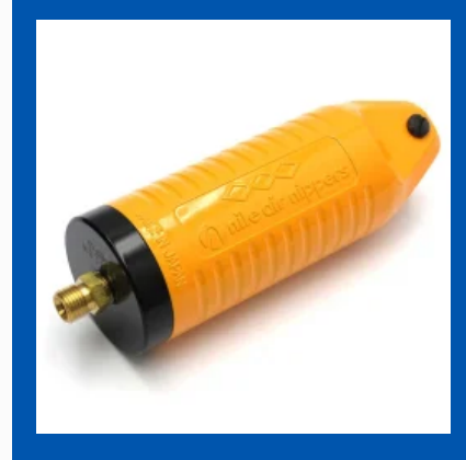
Nile Air Nippers