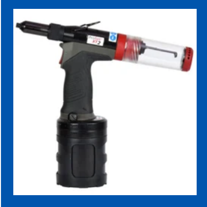
Stanley : PROSET-XT2