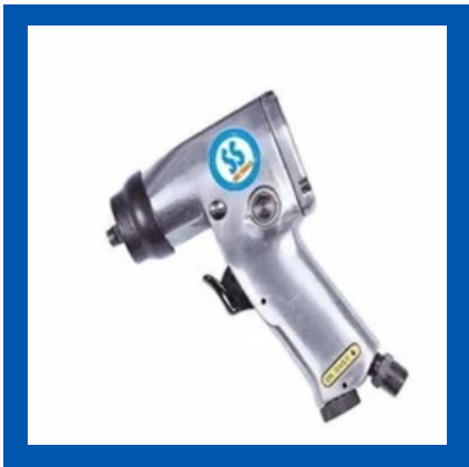
SS Air Tools SINGLE HAMMER SG -0775 3/8" Impact Wrench