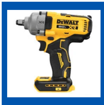
Dewalt Impact Wrench