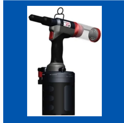
STANLEY: PROSET XT-4