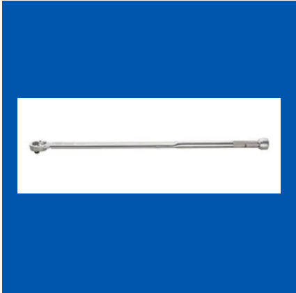
Tohnichi Torque Wrench