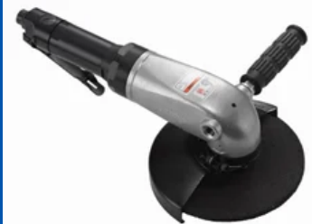
Daewoo Heavy Duty Angle Grinder