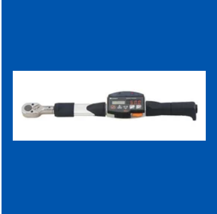
Tohnichi Digital Torque Wrenches