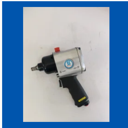
SS Air Tools TWIN HAMMER 1/2" Impact Wrench