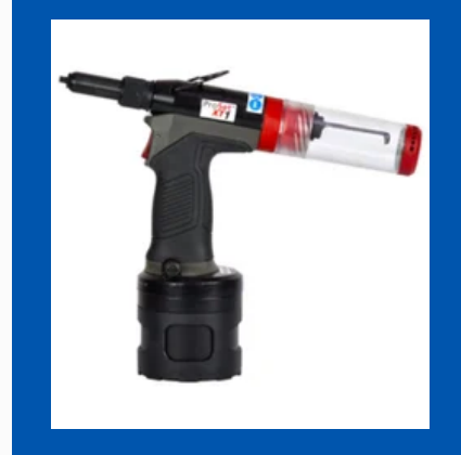
Stanley : Proset-XT1