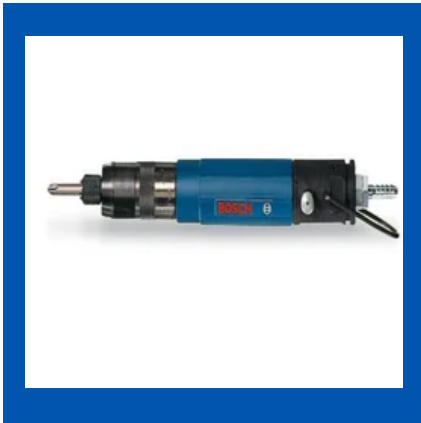
Pneumatic Air Screwdriver