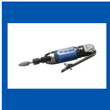
DAEWOO DG-38L & DG-38S Die Grinders