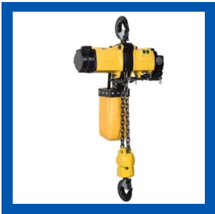
ENDO CHAIN AIR HOIST EHL SERIES