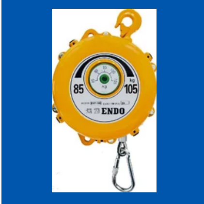
Spring Balancer 105 Kgs