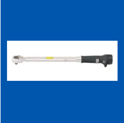
Click Type Torque Wrench