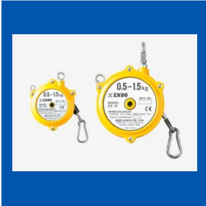
Spring Balancer 0.5 TO 3 KG