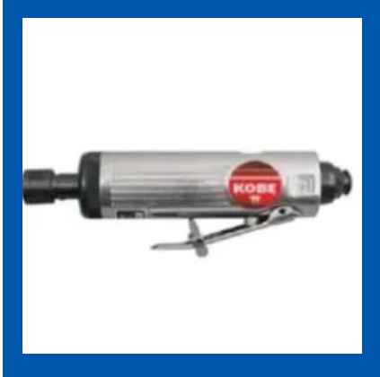
Straight Die Grinder