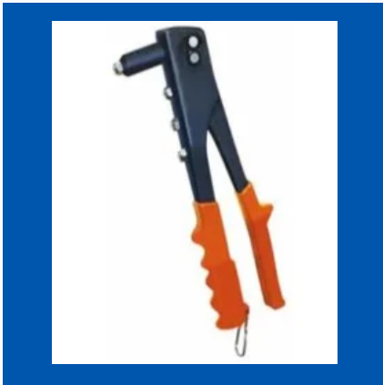
Pop Nut Hand Tool