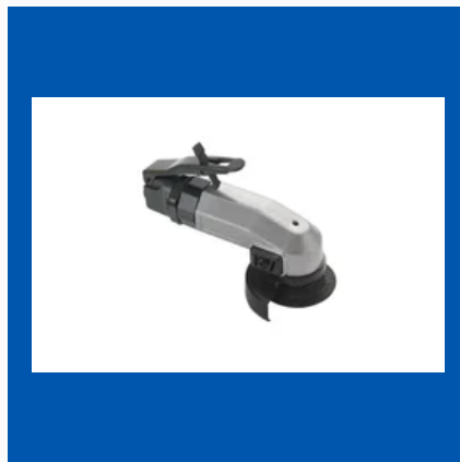
DAEWOO 2" ANGLE GRINDER