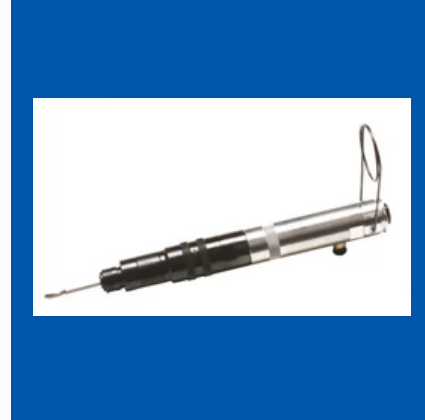
DAEWOO AUTO SHUT-OFF SCREWDRIVER