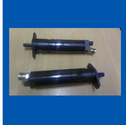
Non Reversible Air Motor