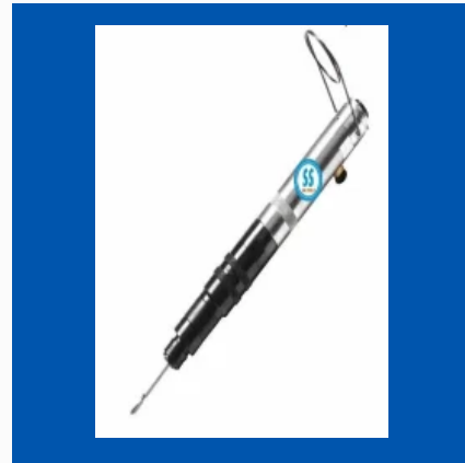
Daewoo Screw Driver (DS- 4TS10)