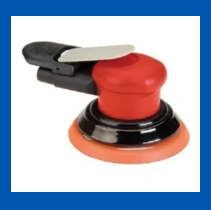
Dynorbital- Spirit Non Vacuum Sander