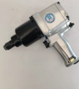
Ss Air Tools Heavy Duty Pneumatic Impact Wrench