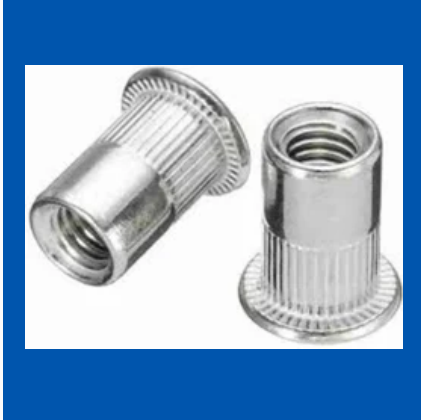
Blind Rivet Nut