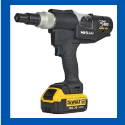
Stanley - PB3400 Battery Tool