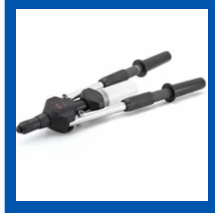
Heavy Duty Lever Tool