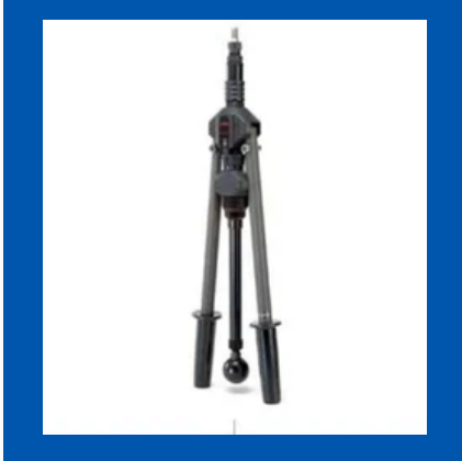
POP Heavy Duty Lever Rivet Tool