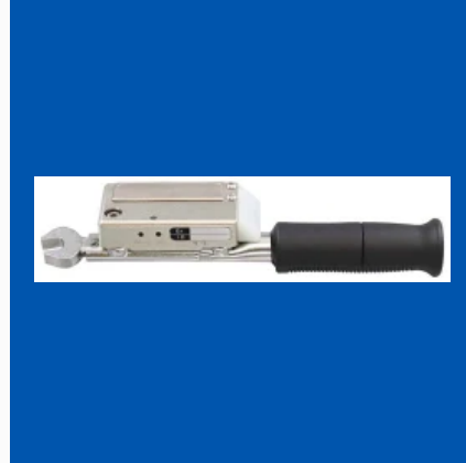
TOHNICHI RADIO FREQUENCY WRENCH