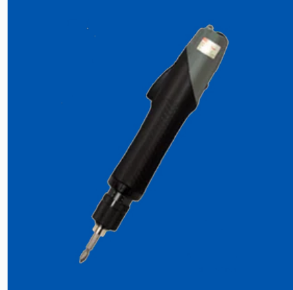
Automatic Tigger Start Clutch Screwdriver