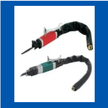
SS Air Tools Air Filer and Air Saw