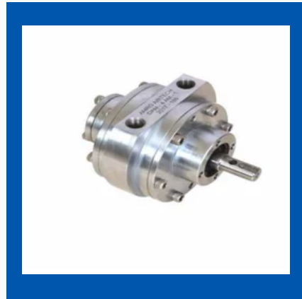
High Speed Air Motor-DAM- 4AM