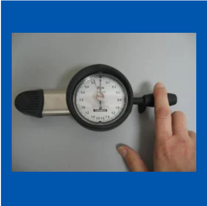
Dial Type Torque Wrenches