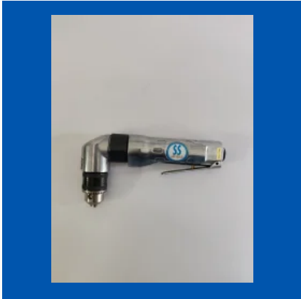
SS Air Tools ANGLE DRILL SM 709