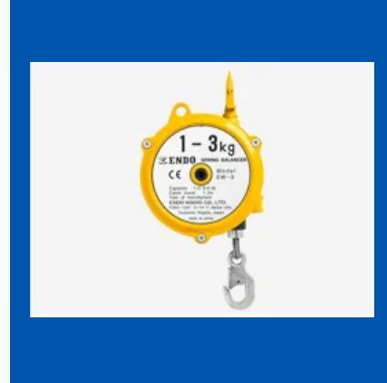
Spring Balancer ( 3-5 KG )