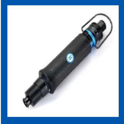
Shut Off Screw Drivers