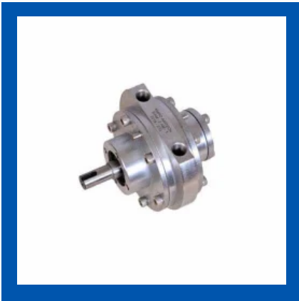
Vane Air Motor-DAM-2AM-1