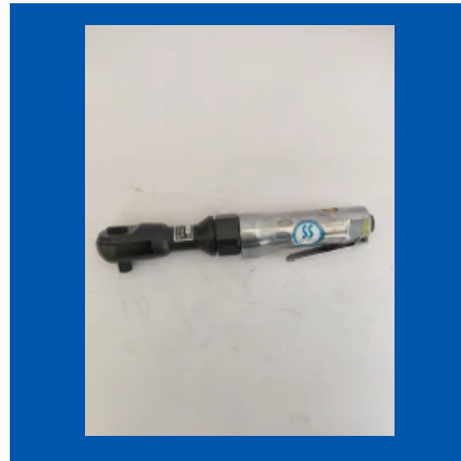
SS AIR TOOLS RATCHET WRENCH SM -31 (1/2'')