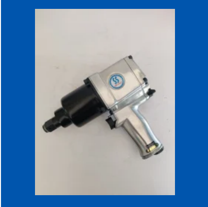
Ss Air Tools Heavy Duty Pneumatic Impact Wrench