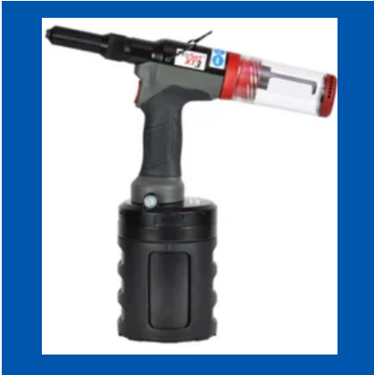
STANLEY: PROSET XT-3