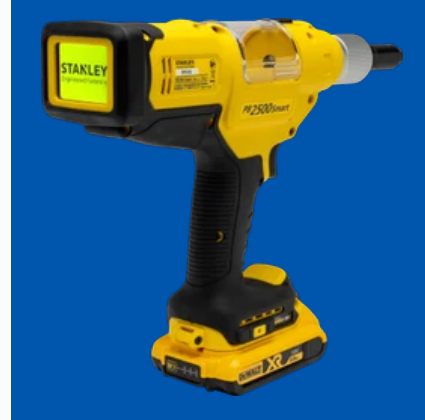
STANLEY PB2500 SMART RIVETING TOOL