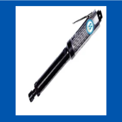
SS Air Tools Die Grinder