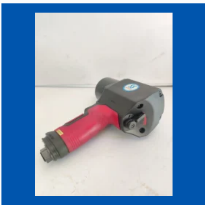
SS Air Tools Composite Body Impact Wrench