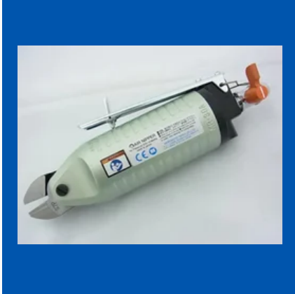
Nile Air Cutter