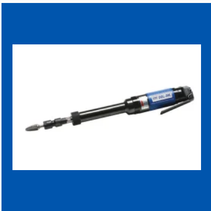
Daewoo Extension Die Grinder