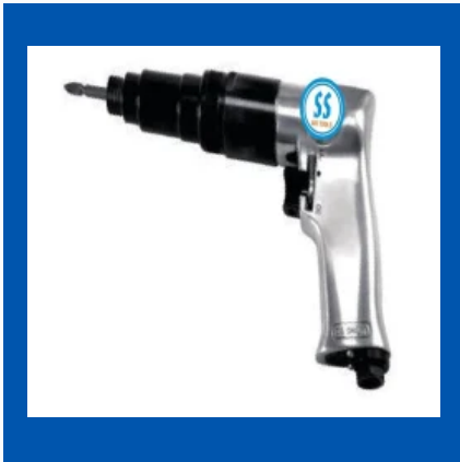
1/4" Adjustable Screw Driver