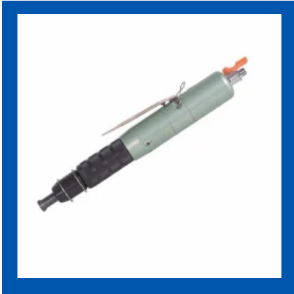
Nile Hammer -RH90