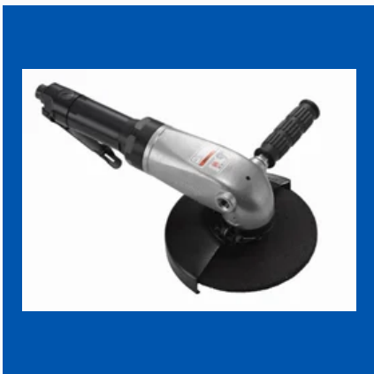
Daewoo Heavy Duty Angle Grinder