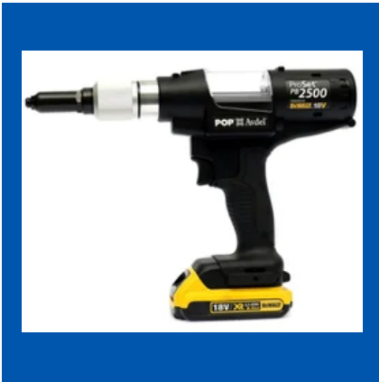
STANLEY - PB2500 BATTERY TOOL